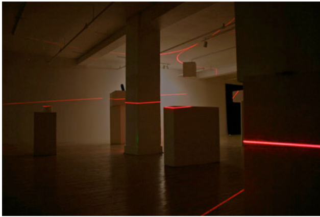
Pierre Gallais MathÉrialisation 2011 Installation view