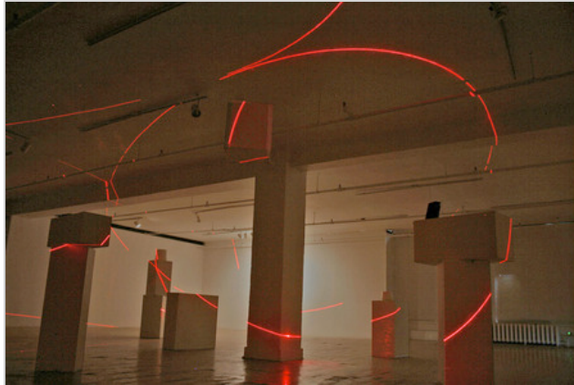
Pierre Gallais MathÉrialisation 2011 Installation view Courtesy the artist